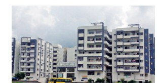
BALAJI GULMOHAR TOWNSHIP - BACHUPALLY