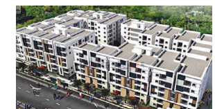
GOLDEN ORIOLE - BACHUPALLY