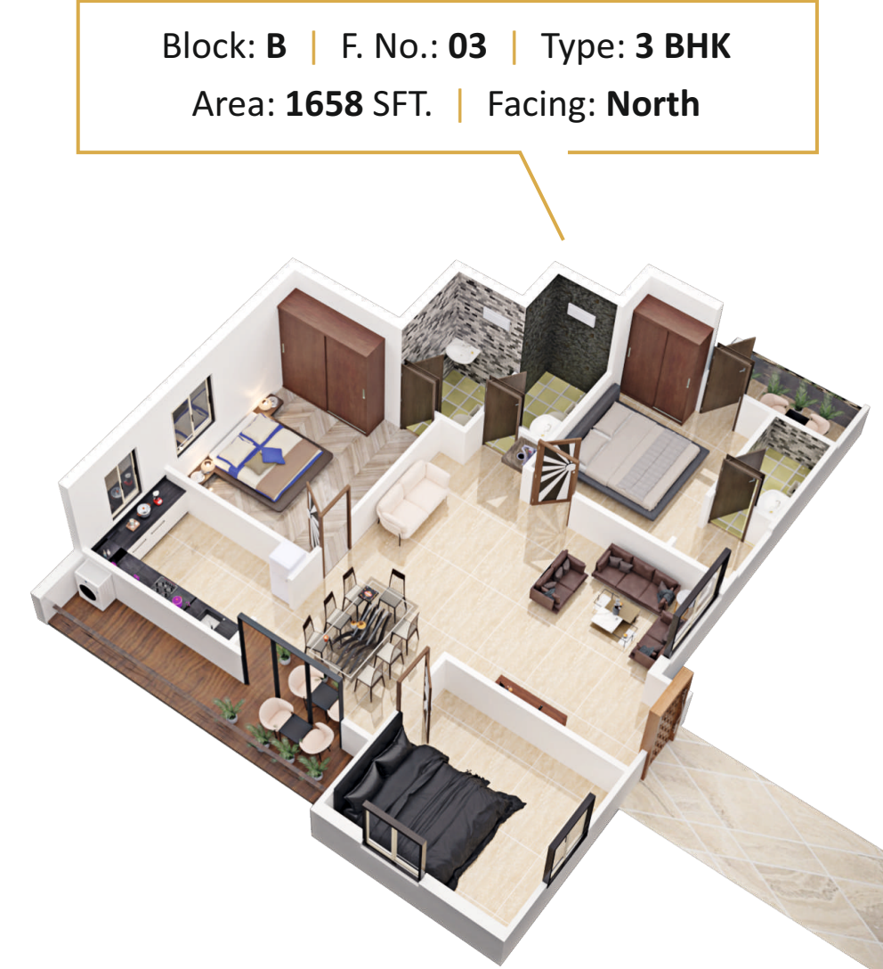
Block: B | F. No.: 03 | Type: 3 BHK Area: 1658 SFT. | Facing: North