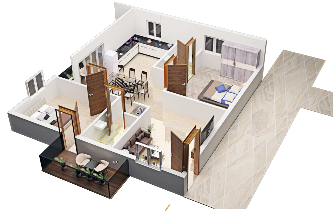
Block: A | F. No.: 01 | Type: 2 BHK Area: 1244 SFT. | Facing: West